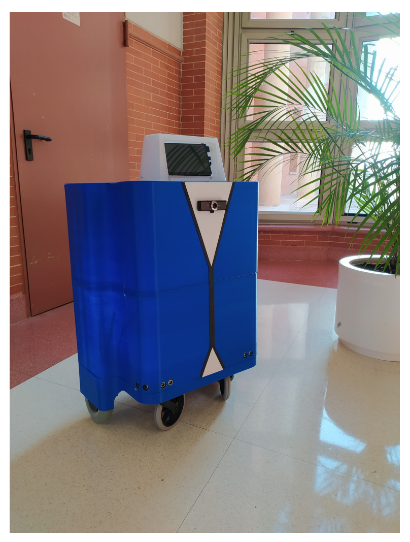
Fig 2. Prototype of AT. https://doi.org/10.1371/journal.pone.0265466.g002

approximately 800 mm, slightly higher than a table. As for the sensors, the platform has: one LIDAR, a touch screen and a frontal camera. The LIDAR takes the measurements of the obstacles used for navigation and localization purposes. Finally, LOLA includes a Jetson Xavier board that has ROS integrated. It is in this board where all the AI functionalities are embedded.